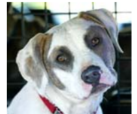
Specs Hound/Pit Mix