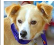
Lil' Punkin Spaniel Mix